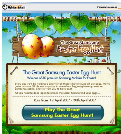
The Easter Egg Hunt

We continue to work with Samsung on a daily basis are working together on some exciting new initiatives which will be launched over the next few months "We've been using eCircle for the past four years and have been consistently happy with them. They provide a very sophisticated email system which allows us to customise our emails to provide a much higher degree of targeting than previously possible. We've already seen tangible improvements in response rates and profile updates to this functionality, which is great" says Turner-Samuels. ■